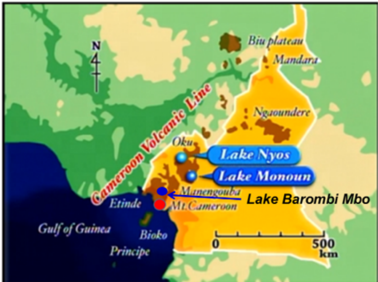
Field trip sites along the Cameroon Volcanic Line