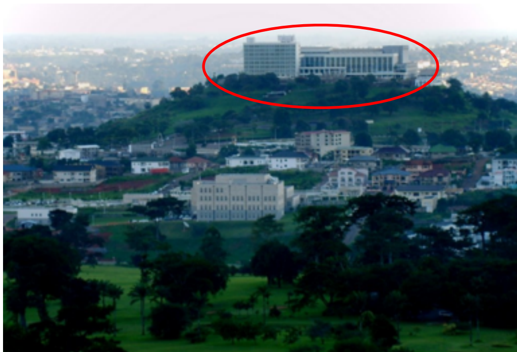
Yaoundé Conference Centre

Venue of the conference: Conference Centre, Yaoundé